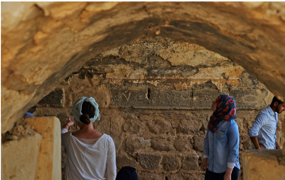
Fig. 4 - Students of the JOAP Guides School visiting Tawaheen es-Sukkar.