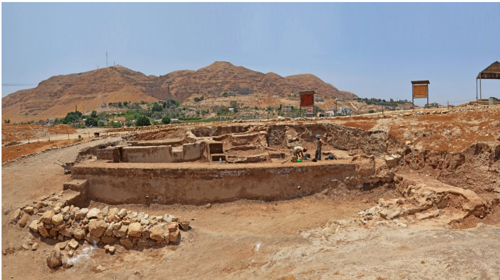
Fig. 20 - General view of Palace G after restoration works.