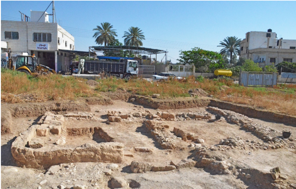
Fig. 9 - Tell el-Hasan, in the Ariha city center, after cleaning and rehabilitation works.