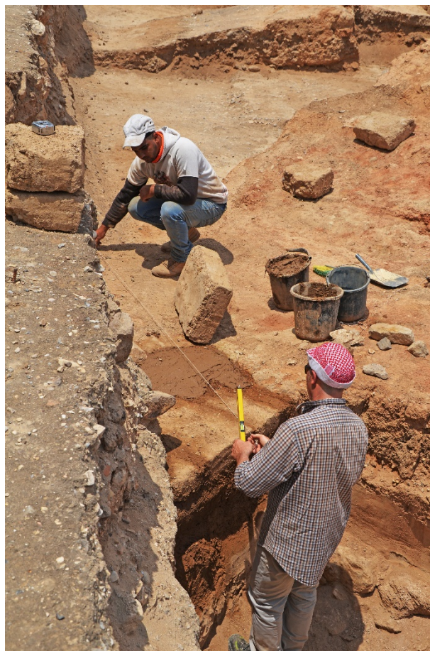
Fig.16 - Restorers preparing the mortar bed for the sacrifice layer of new bricks.