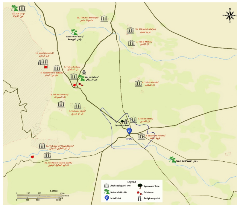
Fig. 2 - Tourist map of the Jericho Oasis with the archaeological, naturalistic and religious sites of the JOAP.