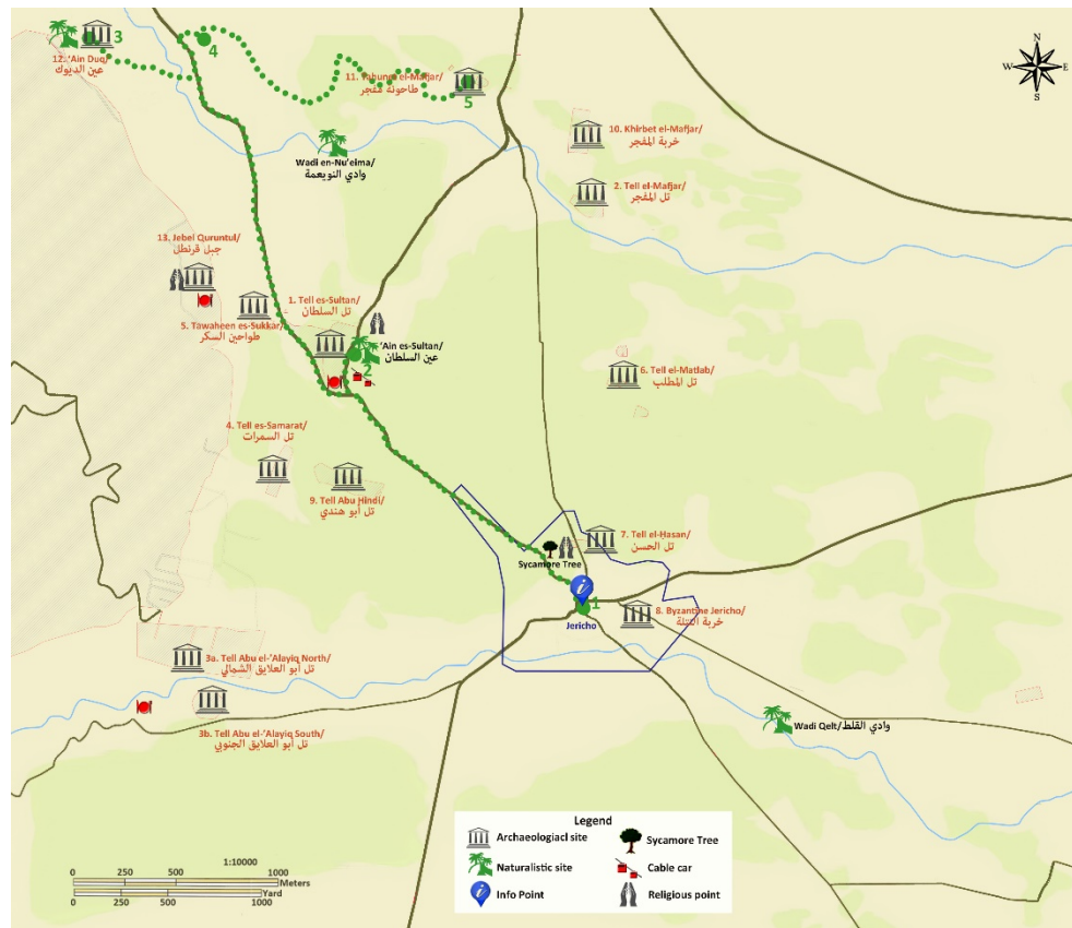
Fig. 12 - Naturalistic Itinerary: “Jericho’s water resources”. This includes: 1. Jericho Oasis Info Point; 2. ‘Ain es-Sultan (JOAP n. 12); 3. ‘Ain Duq (JOAP n. 12); 4. ‘Ain el-Auja (JOAP n. 12); 5. Aqueduct and pool of Khirbet el-Mafjar (JOAP n. 11).