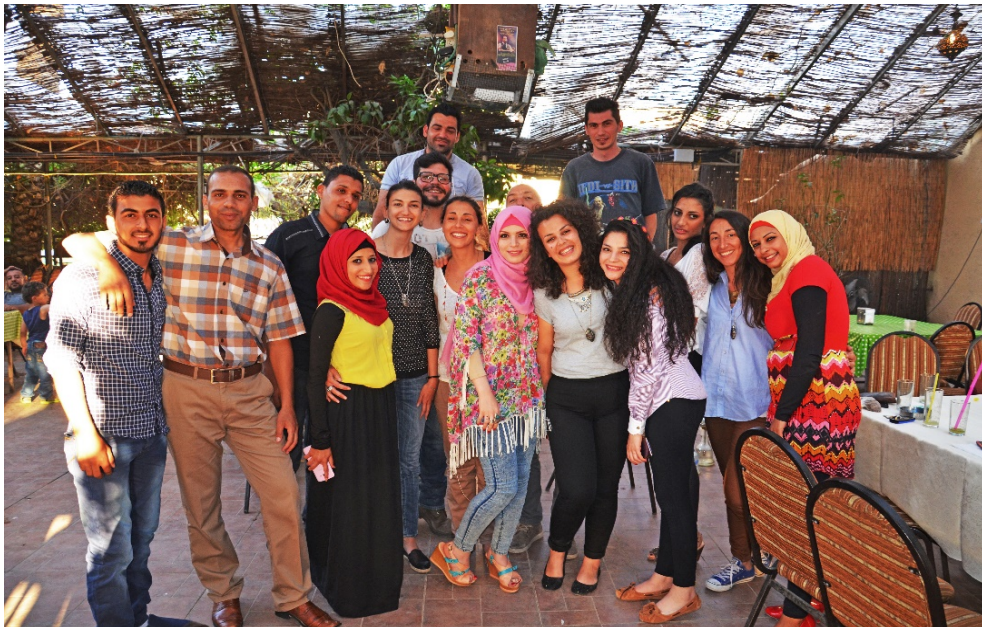
Fig. 26 - Students trained as tourist guides in the last day of the JOAP Guides School.