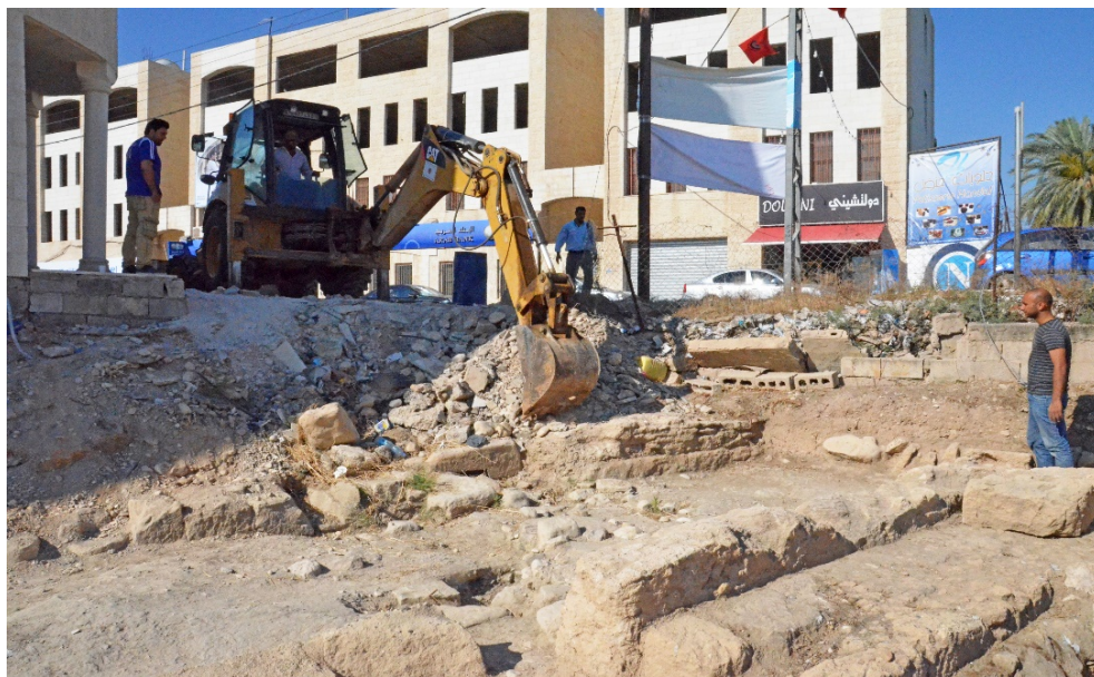
Fig. 8 - Cleaning works at Tell el-Ḥasan carried out in cooperation with the Ariha Municipality.