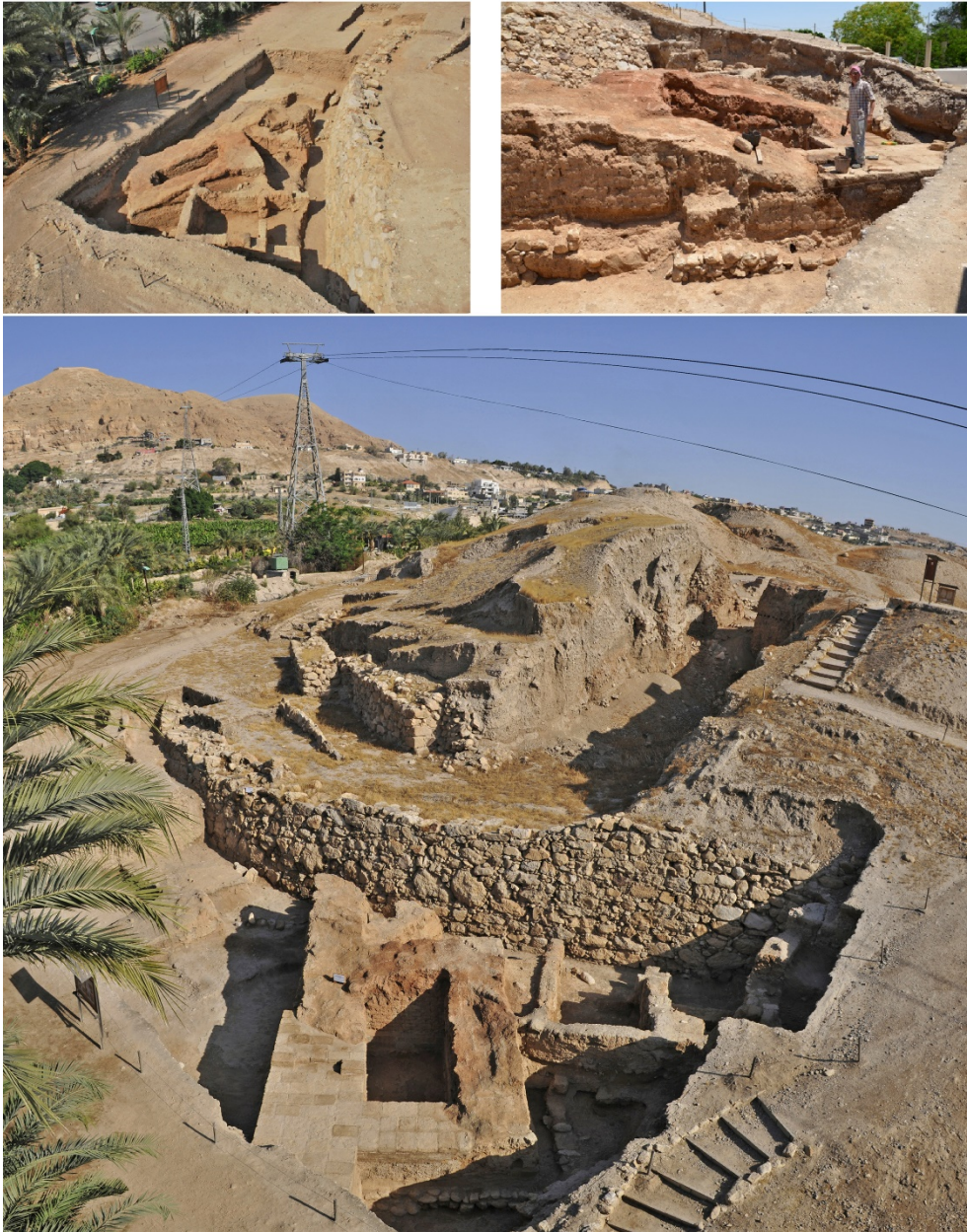
Fig. 14 - Tower A1 before, during and after restoration works.