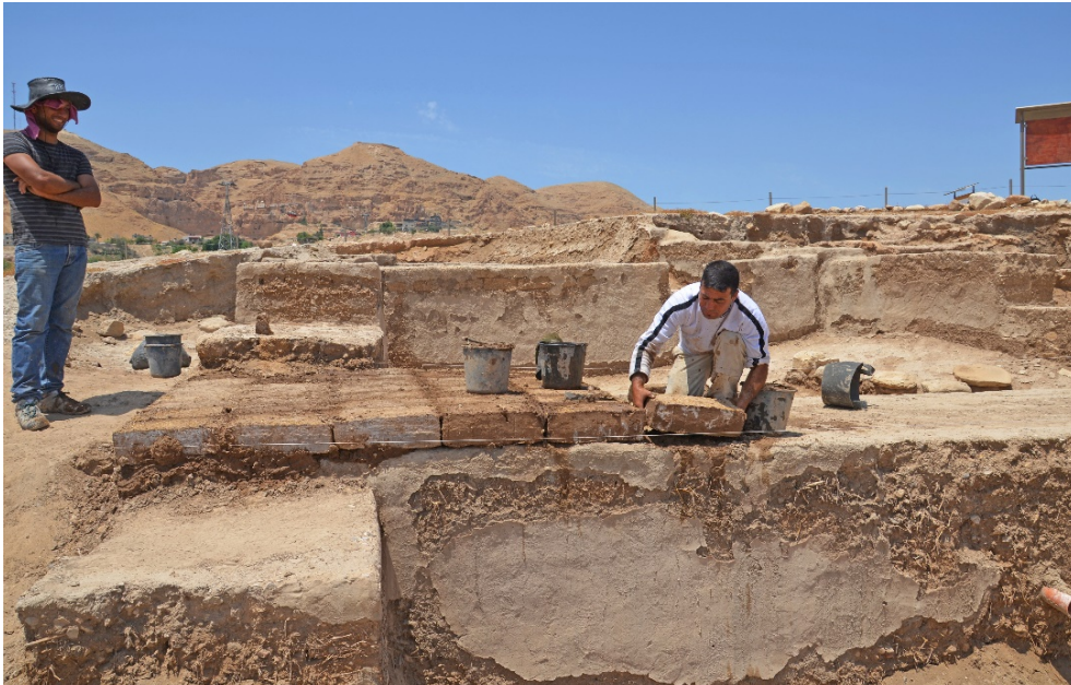
Fig. 21 - Training of a restorer laying bricks on the main wall of Palace G.