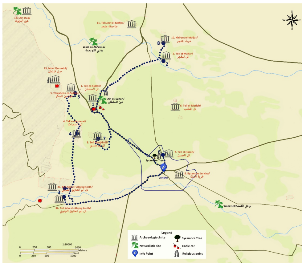
Fig. 11 - Archaeological Itinerary 1: “The Jericho Oasis in history”. This includes: 1. Tell es-Sultan (JOAP n. 1); 2. Tell el-Mafjar (JOAP n. 2); 3. Tulul Abu el-‘Alayiq (JOAP n. 3); 4. Tell es-Samarat (JOAP n. 4); 5. Tawaheen es-Sukar (JOAP n. 5); 6. Tell el-Ḥasan (JOAP n. 7); 7. Tell Abu Hindi (JOAP n. 9); 8. Khirbet el-Mafjar (JOAP n. 10).