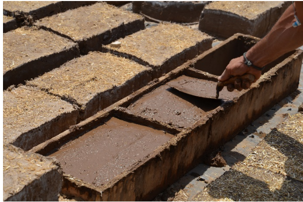
Fig. 15 - Making of mud bricks to be used in the restoration of Palace G.