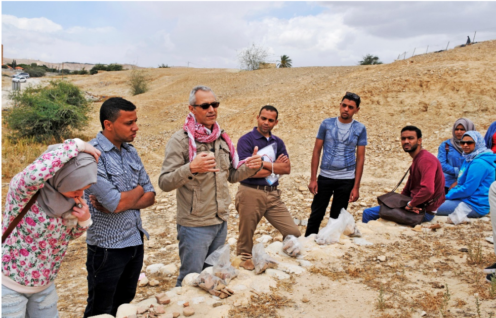
Fig. 5 - Study and classification of Chalcolithic pottery finds in Tell el-Mafjar.