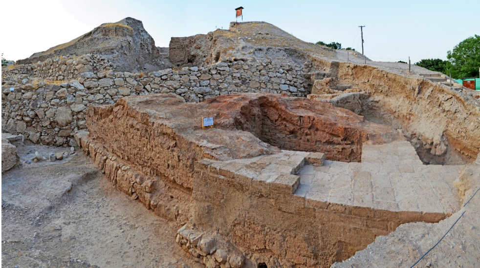
Fig. 19 - Tower A 1 after restoration with new tourist path and a signal giving its name and dating.