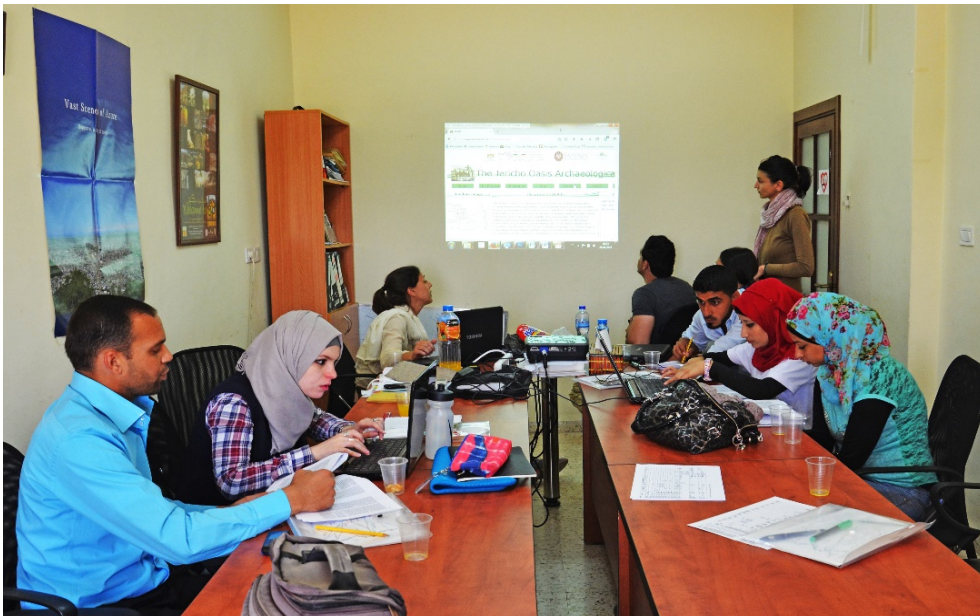
Fig. 6 - Students at work for JOAP panels realization.