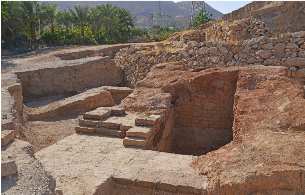
Fig. 17 - Bricks laid on Tower A1.