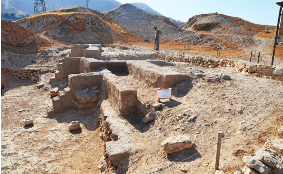
Fig. 25 - General view of Building B1 after rehabilitation with signal indicating name and dating of the monument.