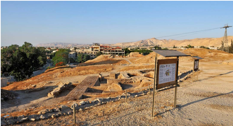
Fig. 24 - Rehabilitated area surrounding Palace G.