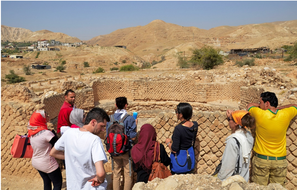
Fig. 3 - Students of the JOAP Guides School visiting Tulul Abu el-'Alayiq.