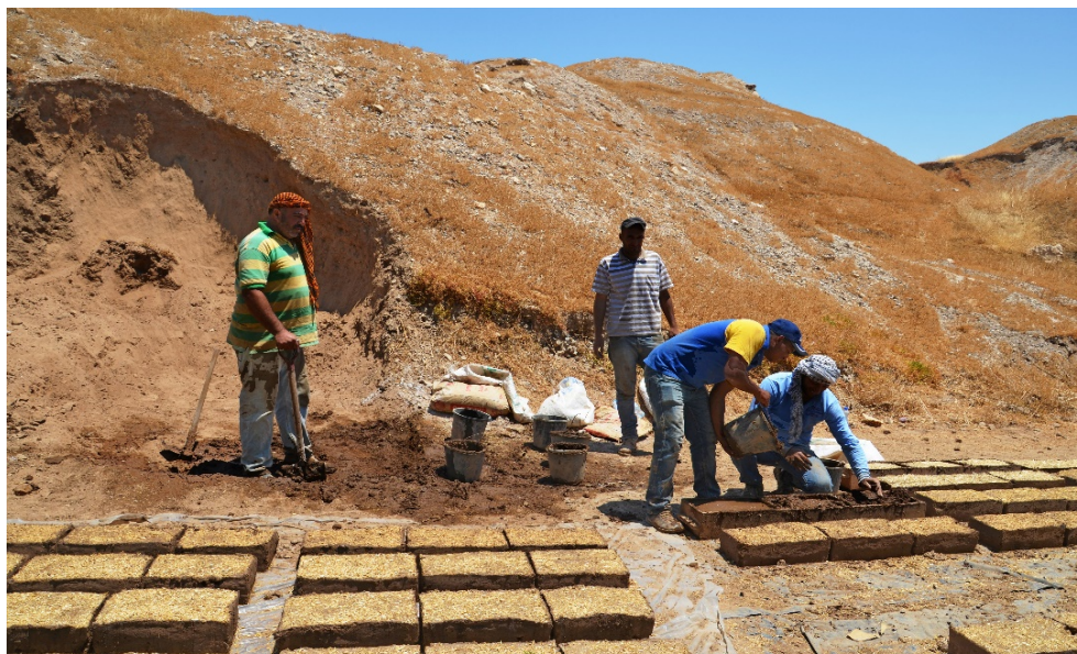
Fig. 28 - Mud brick architecture restorers during training.