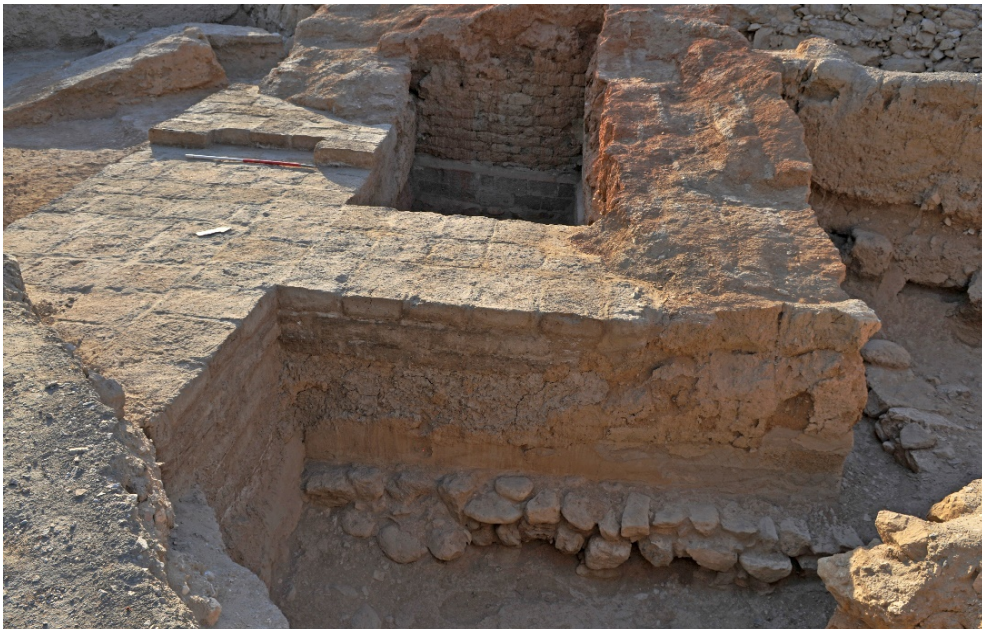
Fig. 18 - The sacrifice revetment layer around the basis of Tower A1.