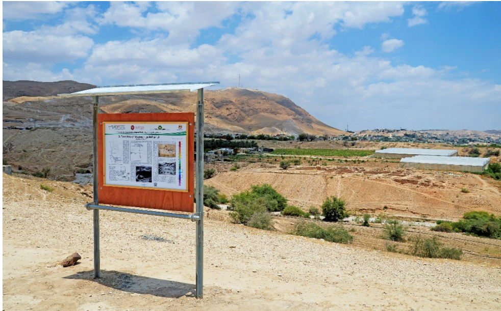
Fig. 7 - The panel at Tulul Abu el-‘Alayiq overlooking King Herod’s palaces.