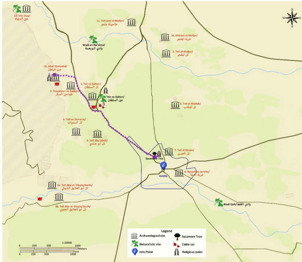
Fig. 13 - Religious Itinerary: "The walk of pilgrims". This includes: 1. Jebel Quruntul, Mount of Temptations and Monastery of Saint George (JOAP n. 13); 2. Sycamore Tree and the Russian Orthodox Museum; 3. The so-called "Fountain of Prophet Elisha" (Ain es-Sultan) and Synagogue of Na'aran (JOAP n. 12).