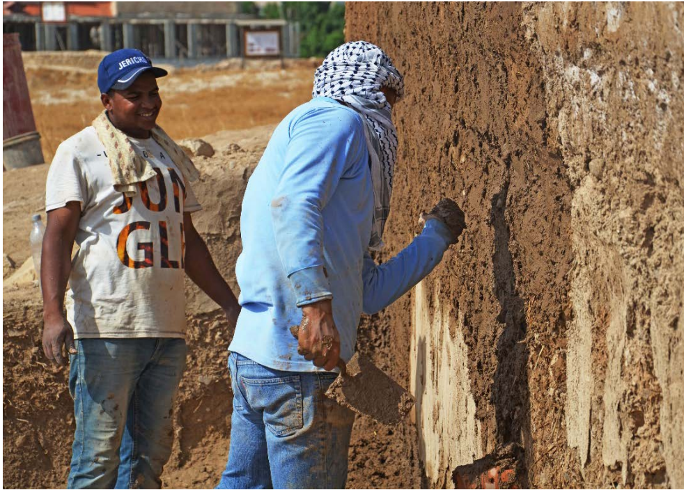
Fig. 23 - Specialized workers coating a mud bricks wall with traditional plaster.