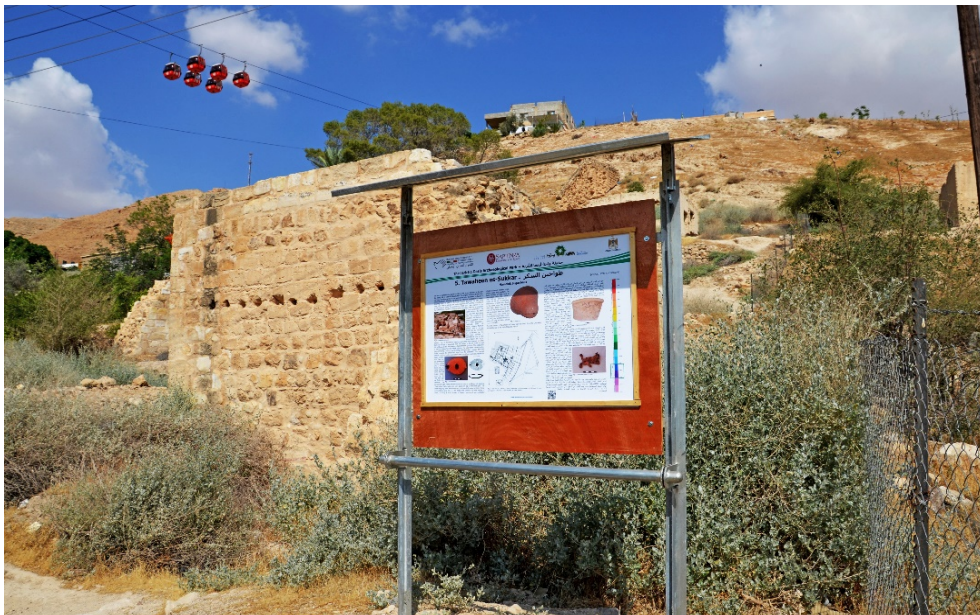
Fig. 10 - The explanatory panel installed in Tawaheen es-Sukkar.