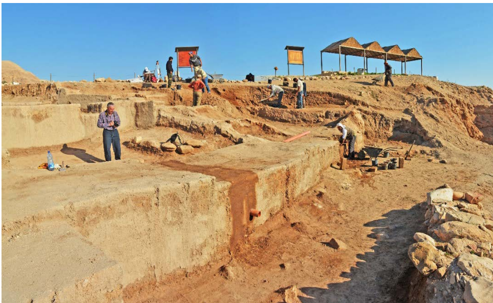
Fig. 22 - Water drainage channel set through Palace G main eastern wall.